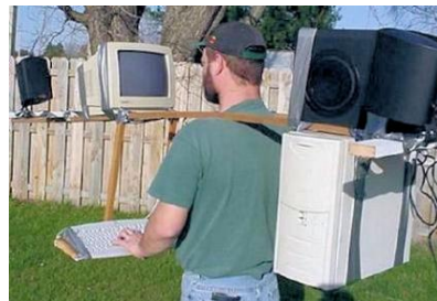
Can't afford a laptop?